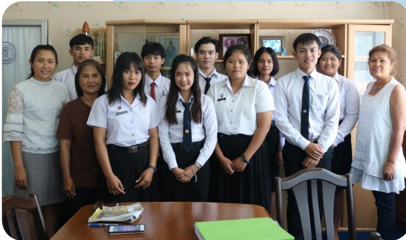
Scholarship Student: Note