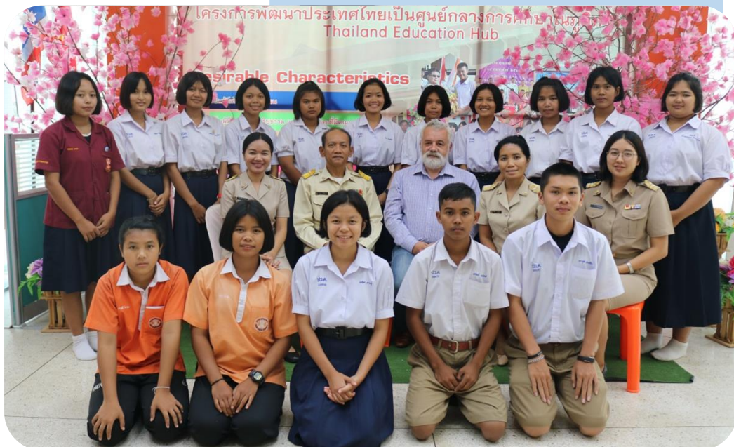
Scholarship Students: Prasat Witthayakan School

In 2019 twenty eight of our active students will graduate. This will allow us to add new students to the program.